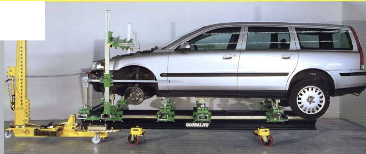
MOBILE BENCH ON WHEELS 4 OR 5 METERS IN LENGTH

Quality: use of the best materials and prime quality workmanship that reflects high industrial standards make GLOBALJIG products a leader in its field.