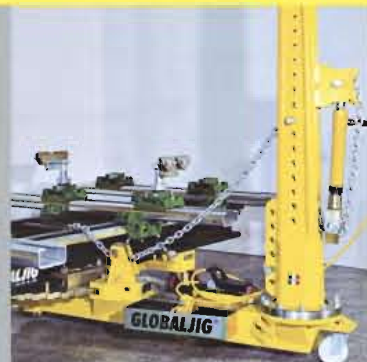
VECTOR PULLING TOWER

The Vector pulling tower, when mounted on the front or rear of the bench and rotating on its support, can cover a work area of 220° for pulling or pushing. It can be mounted in the center of the bench, and with the standard pull-down pulley, can carry out any type of pull.